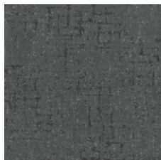
Graphite 84580 LRV 9.7