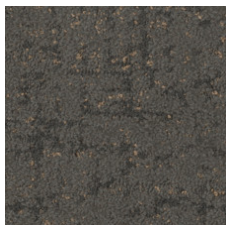
Flint 84761 LRV 8.5