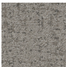
Granite 84105 LRV 22.2