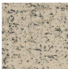
Pebble 84111 LRV 41.3