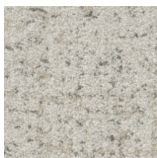
Marble 84100 LRV 44